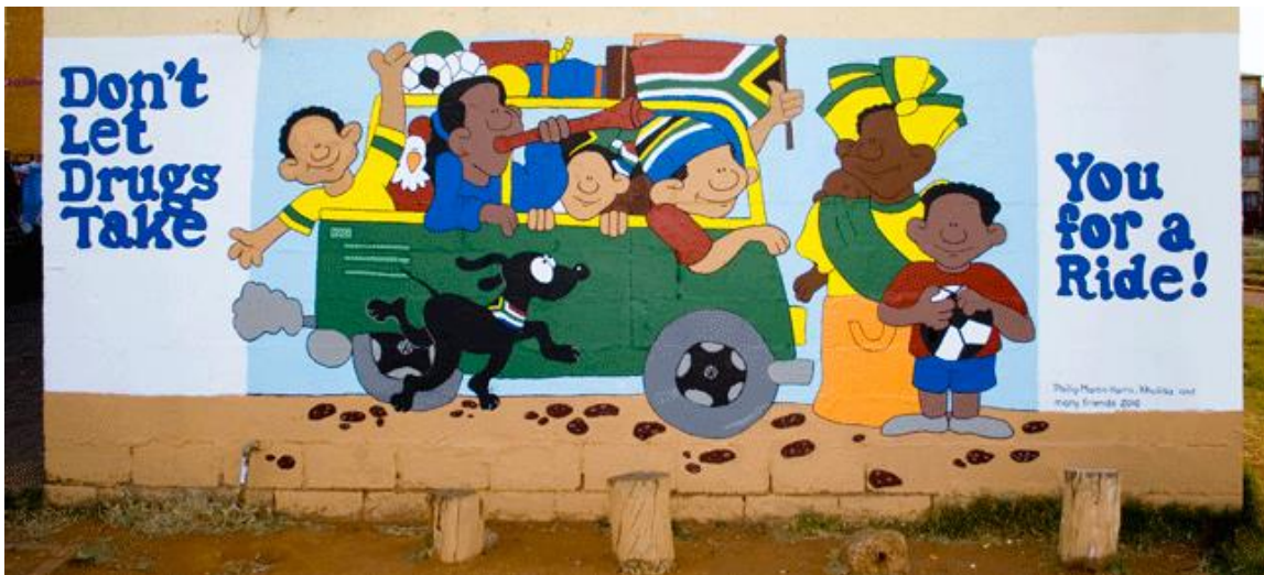
The Mural Man Series, Mural #14

No, it wasn't hard to find volunteers. The mural was about 5 yards by 2 yards so I needed a ladder to reach the higher sections. But, I didn't have a ladder. So, we used giant trash cans instead, risking life and limb for art's sake. For this particular mural, about 35 people joined in. The people in the community were thrilled with the project and message. And, I was the only one to fall from a trash can.