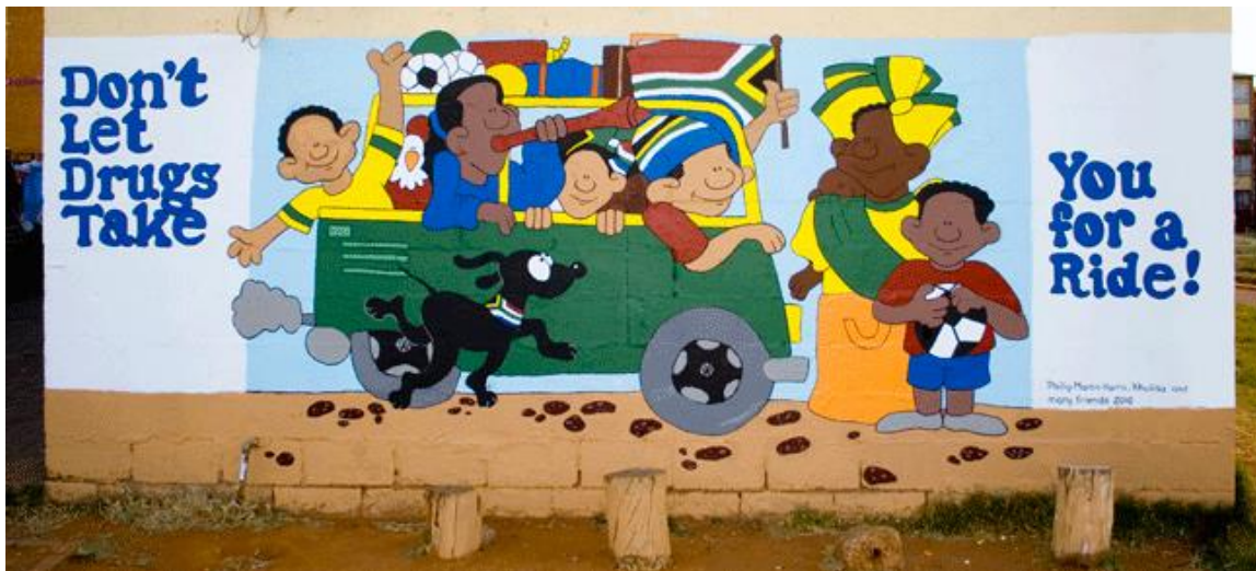
The Mural Man Series, Mural #14

No, it wasn't hard to find volunteers. The mural was about 5 yards by 2 yards so I needed a ladder to reach the higher sections. But, I didn't have a ladder. So, we used giant trash cans instead, risking life and limb for art's sake. For this particular mural, about 35 people joined in. The people in the community were thrilled with the project and message. And, I was the only one to fall from a trash can.